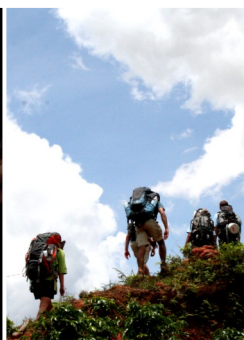
Gold Award Trek