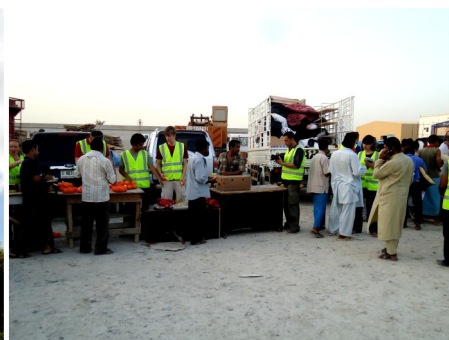
Take My Junk

CAS forms part of the IB Core programme along with Theory of Knowledge and Extended Essay. These aim to encourage not only a love of learning and desire to question but also to develop the fundamental life skills which students will need to become 'ethical leaders' of the global society in which we live.